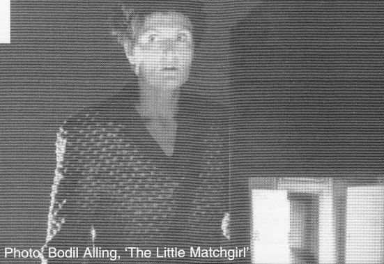
'The Little Matchgirl'